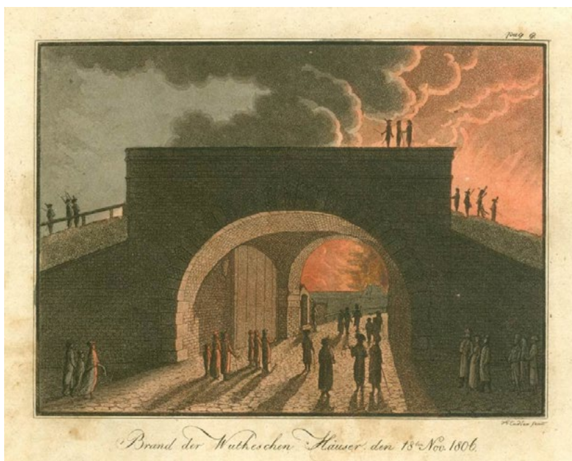
Fig. 4. View of the Odrzańska Gate from the city and the fire of Przedmieście Odrzańskie. Engraving by F. B. Endler