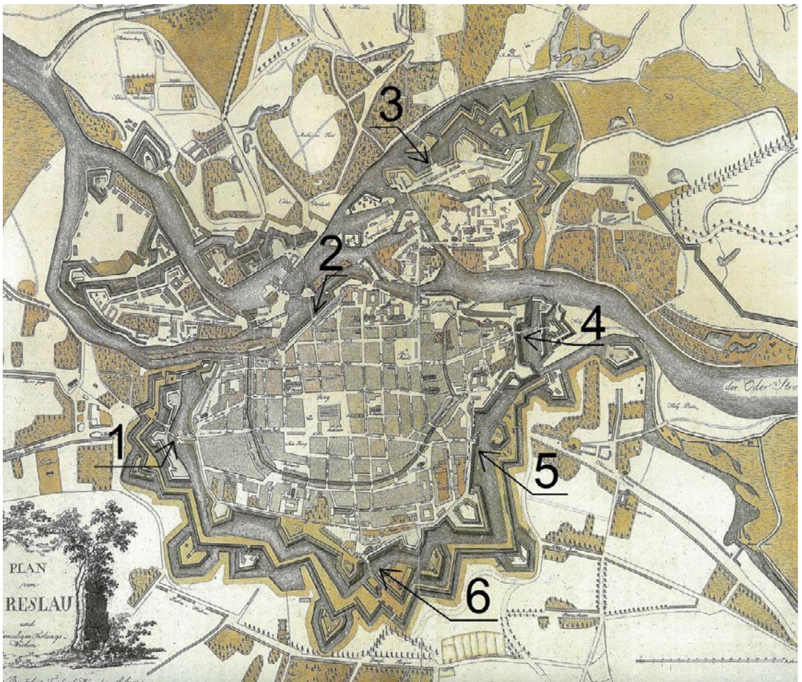
Fig. 1. Plan of the city of Wrocław and its fortifications. Engraving by F. B. Endler from 1807. 1. Brama Mikołajska, 2. Brama Odrzańska, 3. Brama Frydryka, 4. Brama Ceglana, 5. Brama Oławska, 6. Brama Świdnicka.

It showed the fortification system as it had existed before being dismantled (Fig. 1.). The process of demolishing the fortress initiated by the French was continued intermittently for the years that followed and the destruction of other works of military architecture lasted until 1838 [4, p. 32]. The detonations to bring down city walls began already on January 9, 1807 [1, p. 1108]. The Bastion of St. Job was destroyed along with nearby city walls (currently the area of ul. Slowackiego). Additionally, the embankments located at the Oławska Gate (currently the area at the intersection of ul. Podwale and ul. Oławska) were levelled. The earth excavated in the land leveling process was used to fill sections of the city moat (to change its course). Thus, the „inner city” 2 was connected with north-eastern and eastern suburbs around it. At the same time, the fortifications located near the Mikołajska Gate (the area of today’s pl. Jana Pawła) and at Kępa Mieszczkańska were being demolished. The wooden palisades surrounding the city were also systematically dismantled. Further demolitions included walls near the Sakwowy Bastion (now Wzgórze Partyzantów) and fortifications of the so-called Miedzymurze (bailey) located near the Świdnicka Gate [5, p. 120]. The earth from the dismantled fortifications was used to change the course of the moat, which in this section resembled its current shape. Thus the „inner city” was opened to the areas in the south.