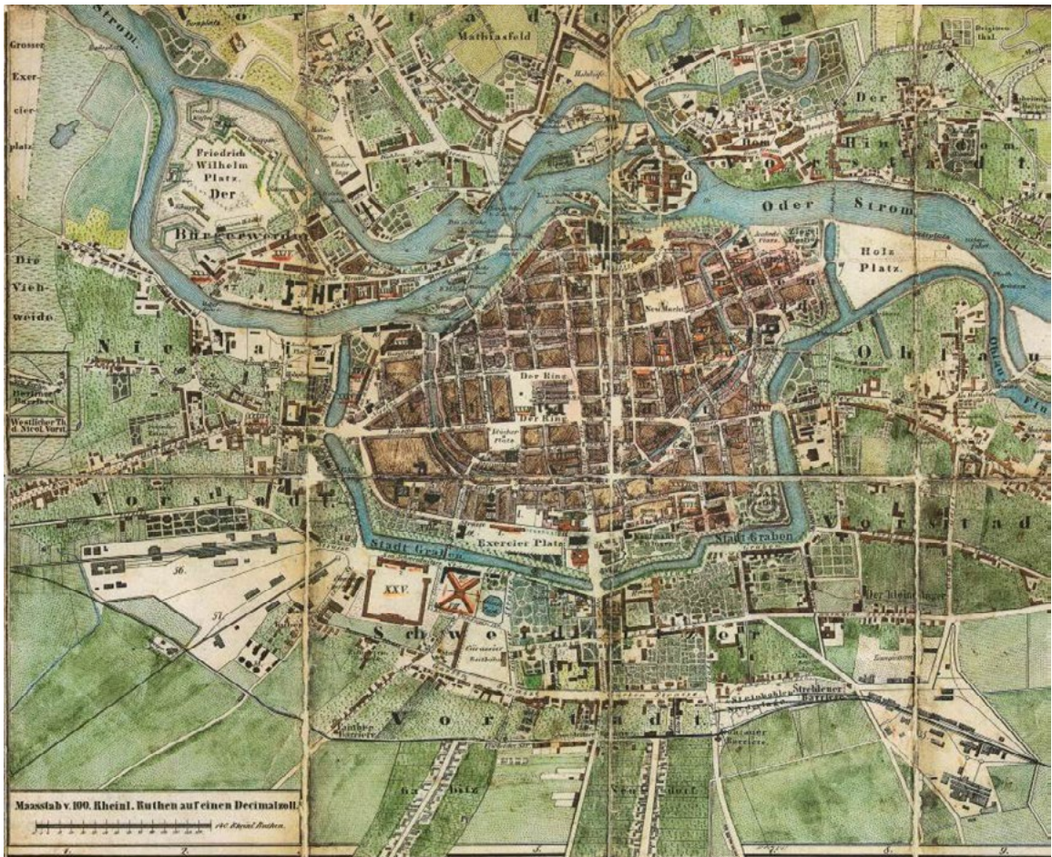
Fig. 5. Plan of the city of Wrocław by Carl Studt from 1853.

This compact area of greenery, which the city had lacked before, has become the favorite place for Wrocław residents to rest and go for walks.