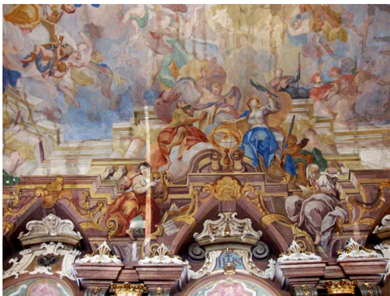
Fig. 3. The Leopoldine Hall in Wrocław – illusionistic ceiling painting.