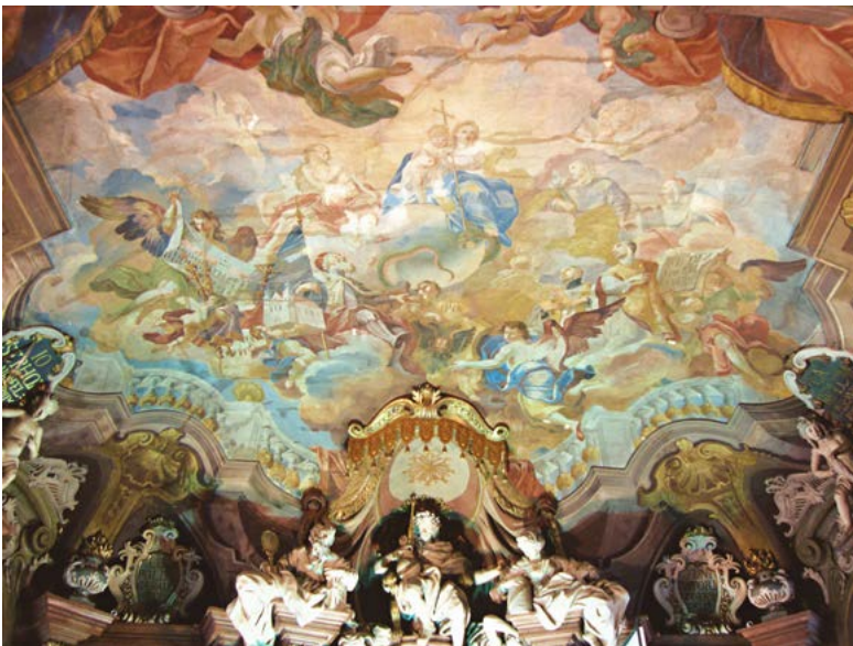
Fig. 2. The Leopoldine Hall in Wrocław – illusionistic ceiling painting.