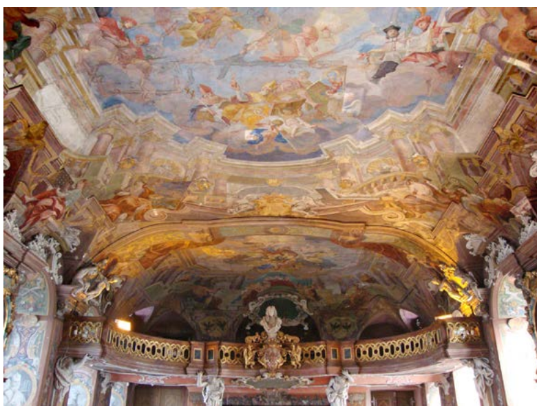
Fig. 4. The Leopoldine Hall in Wrocław – illusionistic ceiling painting.

Omitting many interesting facts relating to history and art, let us focus on geometry of projected images in their painted forms.