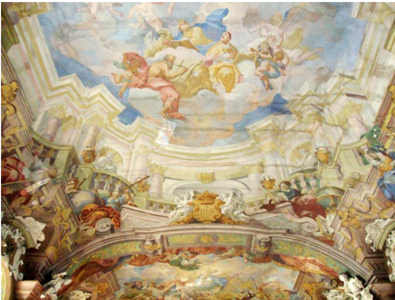
Fig. 1. The Leopoldine Hall in Wrocław – illusionistic ceiling painting.

The Leopoldine Hall is the most representative hall in the main building of what is today known as the University of Wrocław. The very name brings back the memory of the founder, Emperor Leopold I who, in 1639, temporarily donated the family castle to the Society of Jesus. The campus was constructed at the turn of 17 th and 18 th century and included the church (completed in 1700) and an academic institution later known as the University. In both cases, among the studied disciplines ( mathesis ), apart from geometry and astronomy there was architecture.